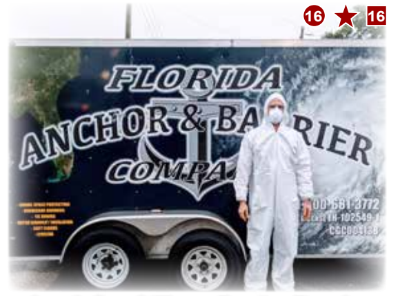
Insulation & Vapor Barrier Repairs Soft Floor Repairs & Laminate Flooring

As a company, we want your business and there is no need for any contact if you so choose. Our business is deemed an "Essential Business" and we are here for you when you need us. You can schedule your inspection by calling 1-800-681-3772.